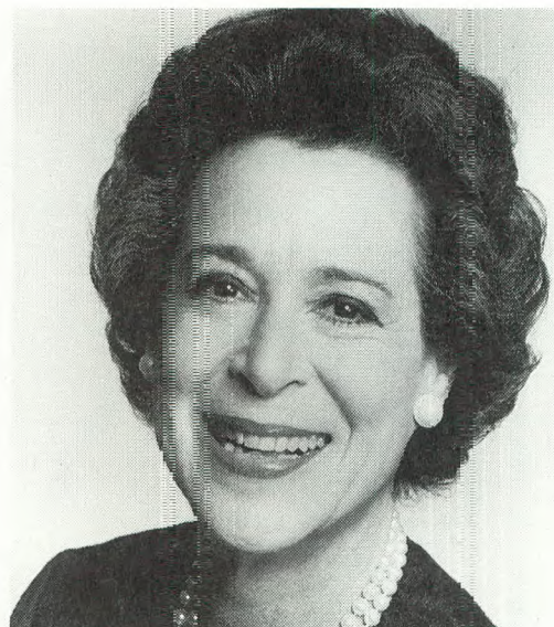
Kitty Carlisle Hart Chairman

So we -- and you -- have come through, and we sincerely hope the worst is over. Already there is some light on the horizon, for as many of you know, our budget for the upcoming fiscal year, 1993-94, has been set at a figure $3 million higher than this year's. Much of that increase came about through your efforts. On top of everything else you do you were able to do that, too. Thank you, one and all, and we -- staff and Council members together -- will do all we can to vindicate your hard work.