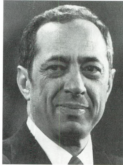
Mario M. Cuomo Governor

Once again, the New York State Council on the Arts has successfully met the challenge of maintaining New York State's position as the national leader in the arts through their support of artists, arts organizations and arts education. The national recession summoned government agencies at all levels to find new and better ways to provide services. The Council responded admirably, continuing to fulfill its mandate to bring the arts in all their diversity to all the people of this great State. I congratulate Kitty Carlisle Hart, the Council members and the Council staff for their efforts.