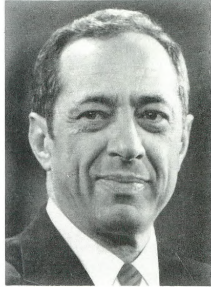
Mario M. Cuomo Governor

In 1993-94, New York's economy exhibited renewed vigor, permitting the state to provide increased support for many essential services. I was particularly pleased that we were able to increase funding for the New York State Council on the Arts, enabling the Council to provide greater assistance to local arts organizations that do so much to enrich the lives of all New Yorkers. Once again, I thank Chairman Kitty Carlisle Hart, the other Council members and the entire staff of NYSCA for their dedicated efforts on behalf of artists and cultural organizations throughout New York State.