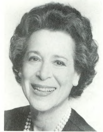
Kitty Carlisle Hart Chairman

As you know, and thanks in large part to your efforts, the budget for 1994-95 has seen a further increase of more than $5 million. We sincerely hope that this is a trend that will continue, and all of us look forward to working with you in the years ahead. Finally, we thank you for all your hard work in helping to maintain New York's premier position in the arts of these United States.